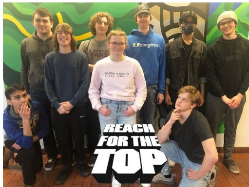
Facey Reach 4 the Top