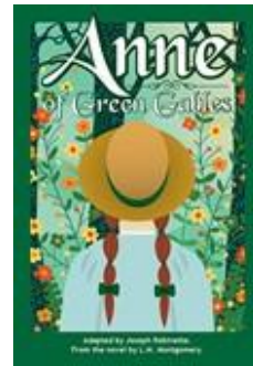
Charlotte's Web & Anne of Green Gables