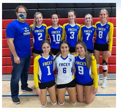
Sr. Girls-Bronze at SPA Invitational