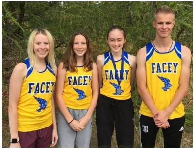
Cross Country Provincials