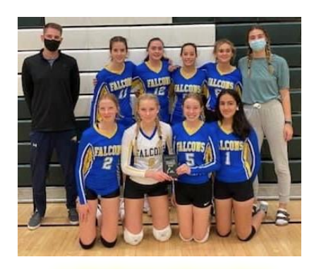
Jr. Girls-Bronze at Spruce Grove Invitational