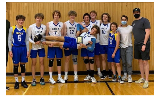
Sr. Boys-Bronze at Tri-Volley Invitational