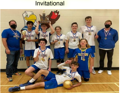
Jr. Boys-Gold at S.C.A. Invitational